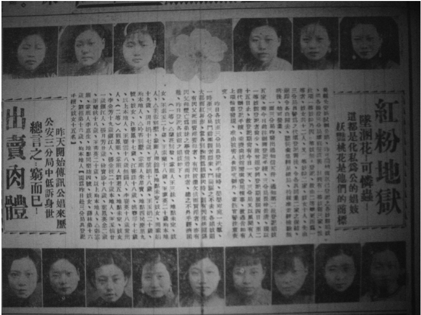
Figure 3: ‘Rouge Hell: Fallen Flowers! Pathetic Insects!’: women register as public prostitutes

fee schedule robbed them of their integrity as working women and that the prices were too low to provide a living wage. 49