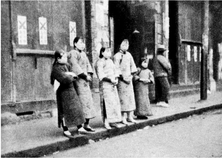
Figure 2: Prostitutes soliciting customers on the street: Republican period